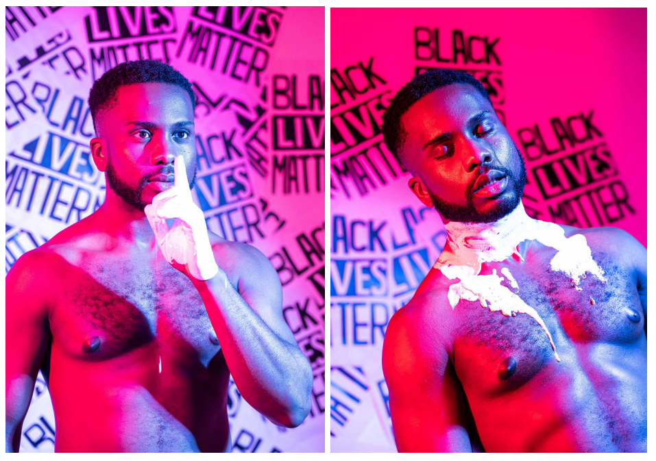
BLACK & WHITE experimental film promotional stills