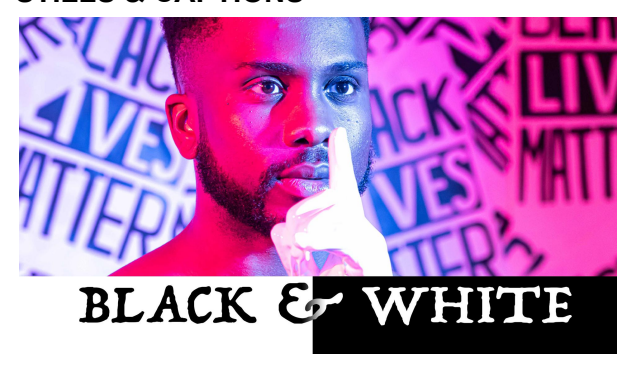
BLACK & WHITE experimental film promotional cover