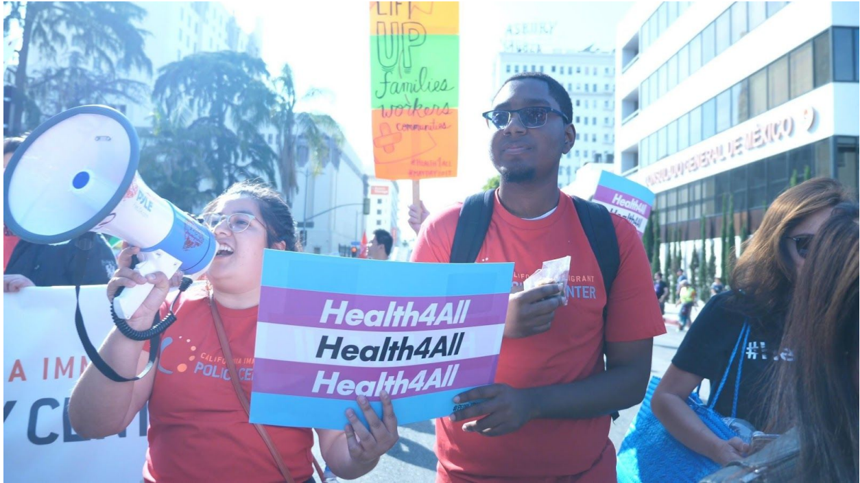
Still 3: Advocates marching in support of the Health4All campaign

Downloadable press stills available online