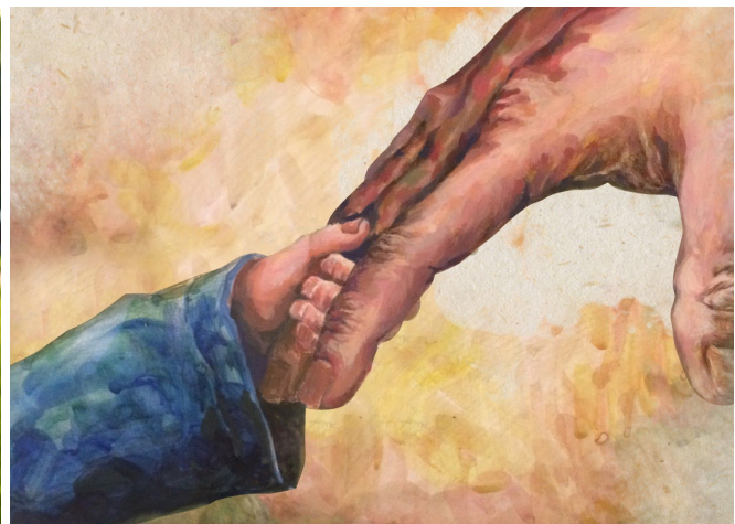
Camilla Tecsý, foster youth, Family Rewritten , ©idesygn creative llc, 2017