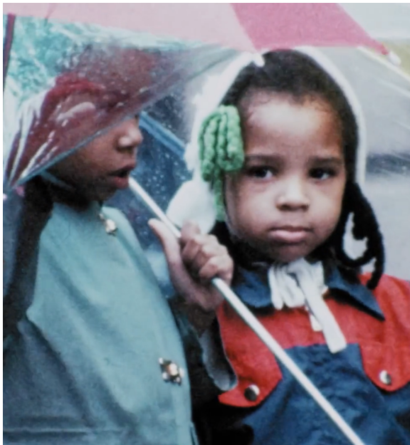
Children Demonstrating, Fresh Seeds in the Big Apple film