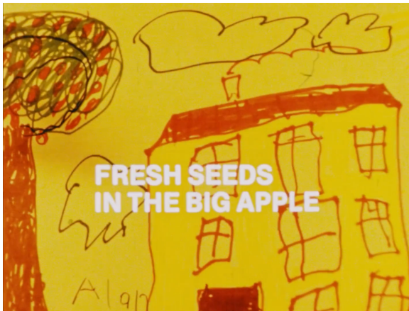
Fresh Seeds in the Big Apple title treatment