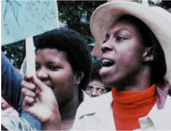
Demonstration at NYC City Hall from Fresh Seeds in the Big Apple film