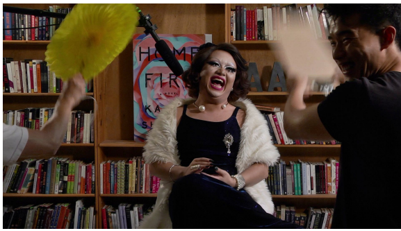
A joyful, behind-the-scenes moment.