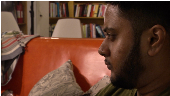
Rathini CU contemplative (profile)