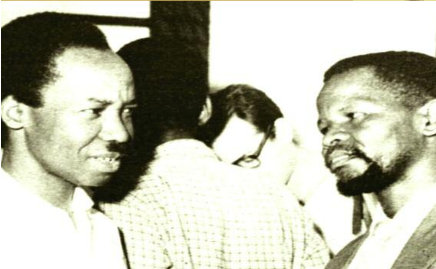
President Julius Nyerere and Oliver Tambo