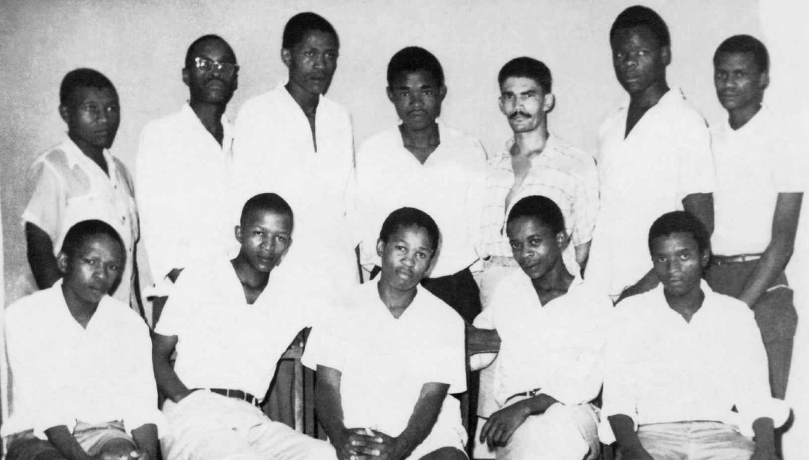
Archival photo of The Twelve Disciples of Nelson Mandela.