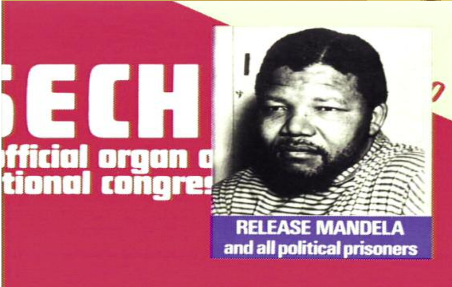
Release Mandela commercial