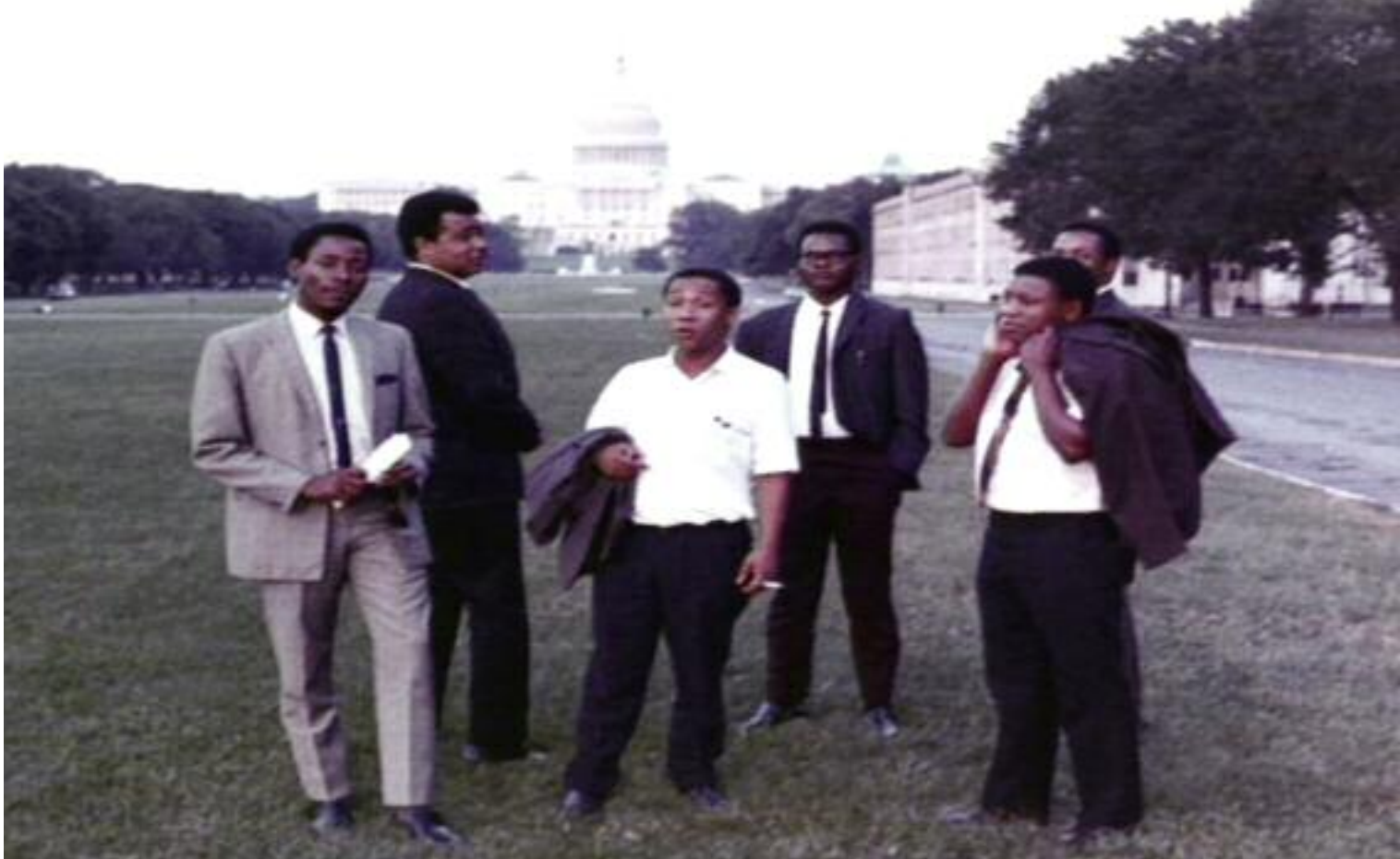
Disciples in US