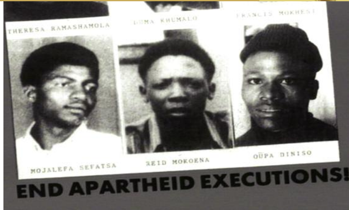
"End Apartheid Executions!" sign