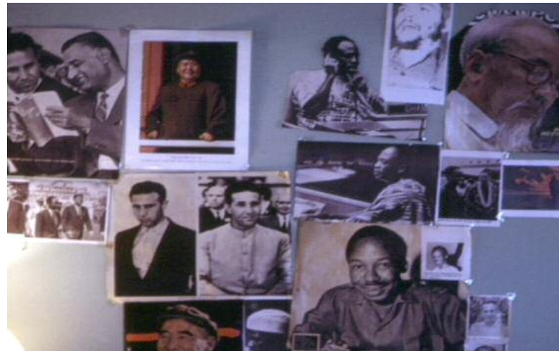
Lee's dormroom at Lincoln University

General Percy Mokonopi (Percy) is the only living disciple who never returned to or visited Bloemfontein. From Tanganyika, he went to Cuba for military training and education, but soon after he arrived, he left Cuba to work with ANC's military wing in Africa. He was the ANC representative in Angola and later served