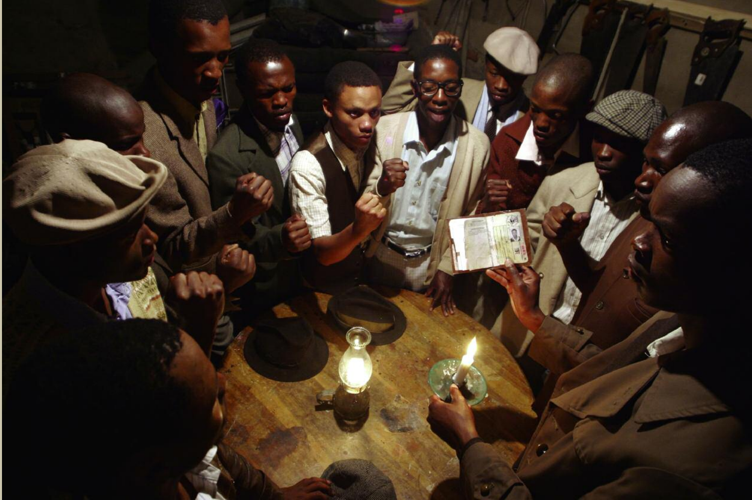
The Twelve Disciples burn their passbooks, 1960, Bloemfontein, South Africa (Dramatic recreation).