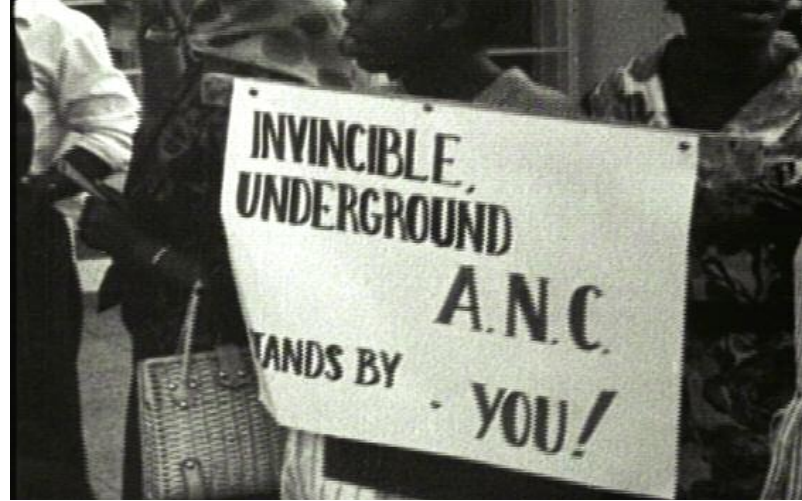
Dar es Salaam, Tanzania, 1961

1960 – In what would come to be called the Sharpeville Massacre, police open fire on a group of peaceful black protestors, killing dozens. The government blamed the PAC and ANC for organizing the protest and officially ban them. Six months after Sharpeville, the “Twelve Disciples” leave the country for Dar es Salaam.