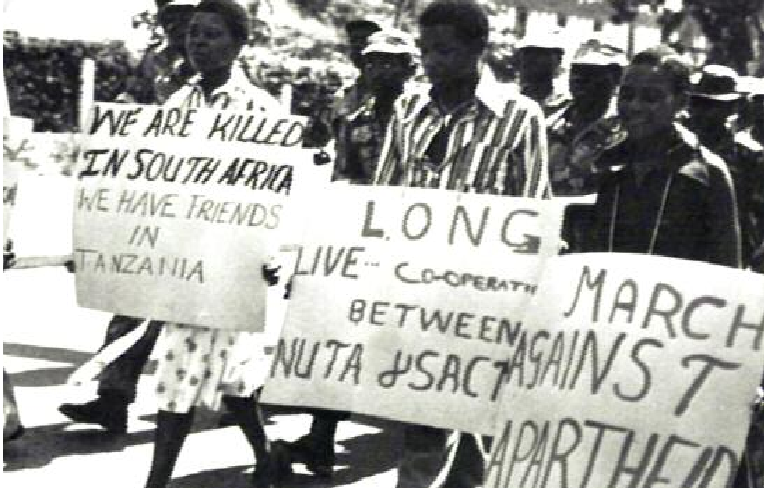
March against Apartheid