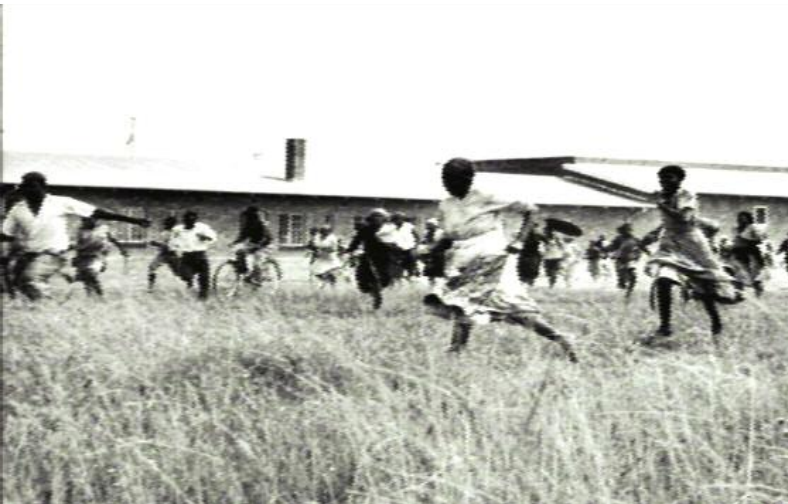
Sharpeville killings, March 1960