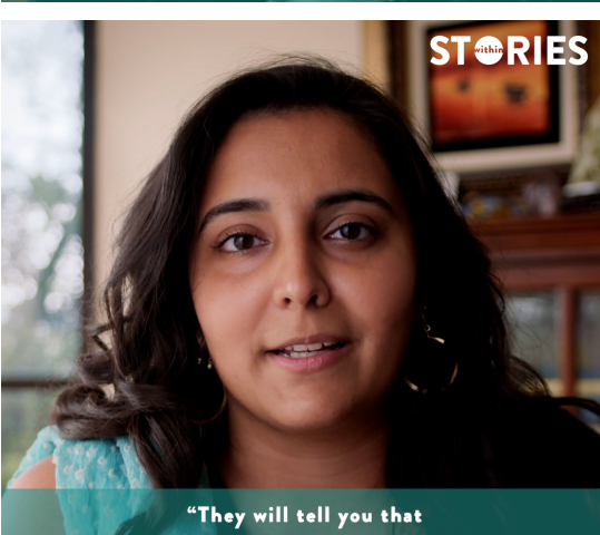
brown girls are supposed to be quiet." -Khushboo